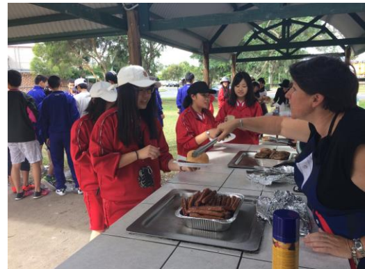
Aussie BBQ with our teachers

Following on from this, we encourage students to do their homework at the