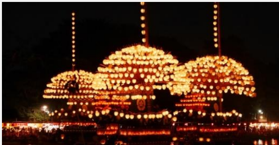
Yoimatsuri , Night Festival (Saturday night)

The 22 nd and 23 rd of this month will see the return of the usual Tenno Matsuri activities. Owari Tsushima Tenno Matsuri is a National Important Intangible Folk Cultural Asset and one of the 33 Japanese festivals included in the "Yama, Hoko and Yatai Float Festivals" of Japan, which is in the Representative List of UNESCO Intangible Cultural Heritage for Humanity.