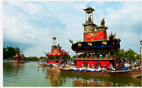
Asamatsuri , Morning Festival (Sunday morning)